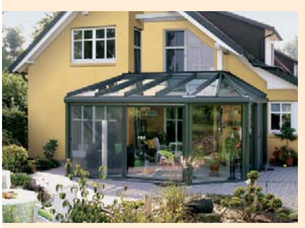
▲ weinor conservatories

No matter what you want to use your patio for, weinor has the right product for you – awning, patio roof, Glasoase® and conservatory