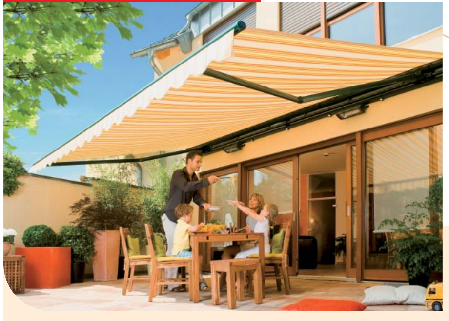
▲ weinor awnings