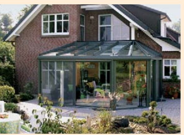
▲ weinor conservatories

▲ weinor patio roofs with VertiTex awning